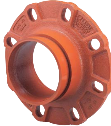
Class 7180 Universal Flange Adaptor